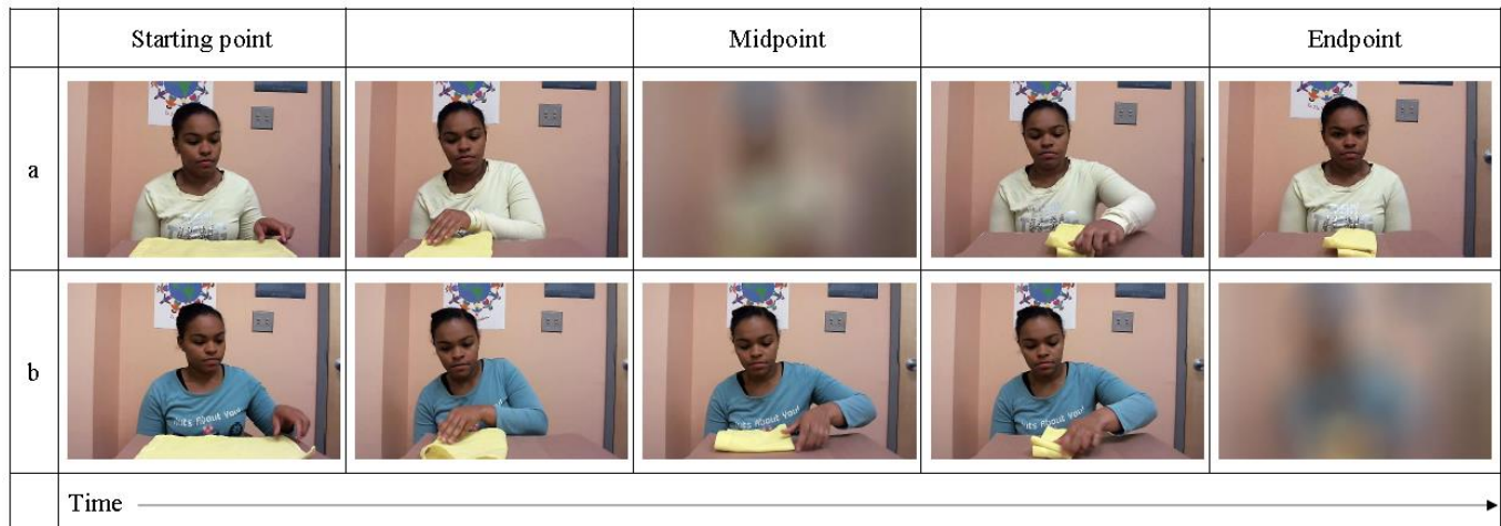
Figure 1. Examples of a training trial for a bounded event (folding up a handkerchief) that includes the two versions of the event: (a) mid-interruption (actor in yellow shirt), (b) end-interruption (actor in blue shirt).

except that the actor wore a blue shirt. All videos were then edited to introduce an interruption during which the screen turned blurry. Each video was edited twice, once to create a mid-interruption and once to create an end-interruption, depending on where the interruption was placed. In all cases, the interruption took up one-fifth of the total video duration.