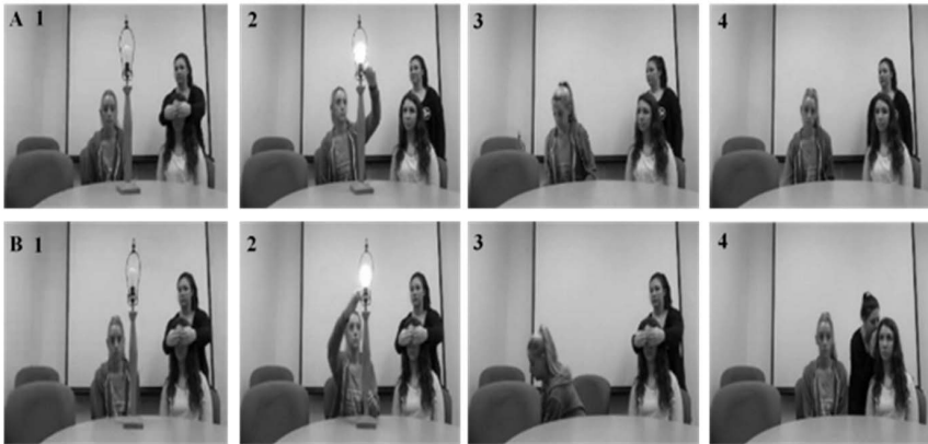
Figure 1. Sample screenshots from versions of a scenario in which a character gained access to an event of someone lighting a lamp either through visual access (A) or verbal report (B)

An example of an event can be seen in Figure 1. For the Visual Access (Panel section A), the Speaker had continuous direct visual access while the Agent performed the event (she lit a lamp, panels A2-A4). To make these videos comparable to the Reportative Access ones, the Speaker's eyes were blocked by the third character in the beginning of all the Visual Access events (A1) but then the Speaker gained Access to the complete event (A2-4). For the Reportative Access (Panel section B), the Speaker's eyes were blocked throughout the event by the third character (B1-3). After the Agent had completed the event and took the materials away from the table, the third character uncovered the Speaker's eyes and was shown whispering to her (B4). For both access types, the video ended with the Speaker turning to the camera to describe what happened. At that time, a speech bubble appeared, containing a sentence in the target artificial language and remained on the screen for approximately 8 seconds before the next video started.