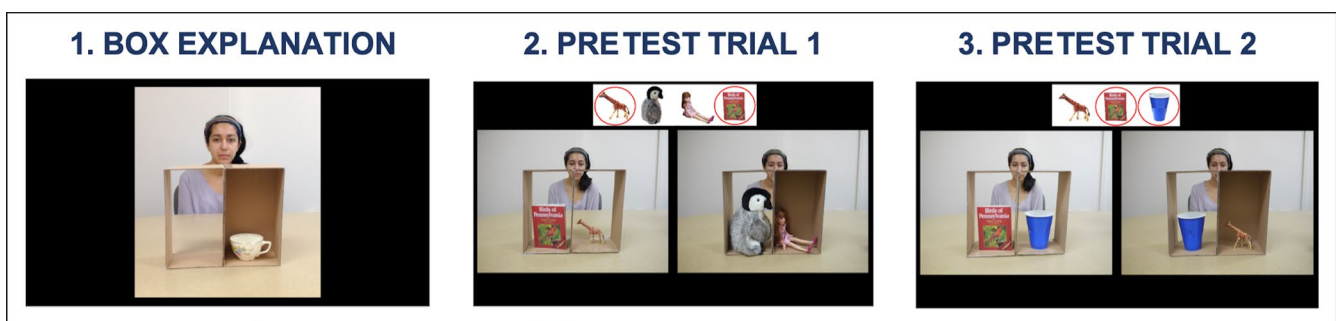
FIGURE 3 Visual displays for the introductory phase of Experiment 3. At the end of each pretest trial, participants heard 'I see this' as an animation of a red circle appeared around two of the objects in the array above the photographs in succession. In pretest trial 1, the picture of the book was circled first, followed by the giraffe. In pretest trial 2, the picture of the book was circled first, followed by the cup

Performance on each condition was compared between Experiments 1 and 3 using Fisher's exact test (we collapsed across age groups in children for simplicity). For adults, there was no significant difference (More-Informative: p = 1 , Less-Informative: p = .215 ). For children, performance was significantly better in Experiment 1 compared with Experiment 3 for the Less-Informative condition ( p = .006 ) but was similar across experiments for the More-Informative condition ( p = .559 ).