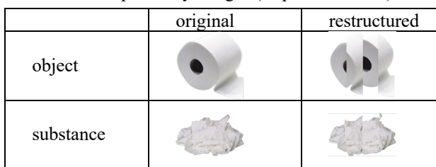
Table 1. Sample entity images (Experiments 1-2)

Linguistic Stimuli In addition to manipulating the entity type that participants are shown, we manipulated the linguistic context that accompanied each item. We had two conditions: count syntax and mass syntax. We created 16 nonce English nouns, all of which were one or two syllables/characters. On each trial, we introduced each novel label (“alien word”) in a full sentence like “You will see { a_{\text{count}} gorp/ \emptyset_{\text{mass}} gorp}.” before showing them the first image. After displaying the second image, we used the novel word again in a sentence with the same syntax (“Was that also a_{\text{count}} gorp/ \emptyset_{\text{mass}} gorp?”). In the count syntax condition, the label was preceded by a/an and in the mass syntax condition, the label was unmarked.